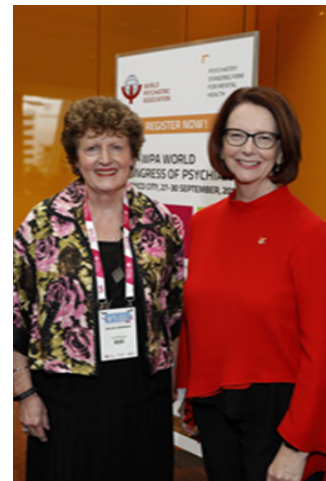
A photo taken at the opening ceremony of the World Psychiatric Association Thematic Congress, 25-28 February, 2018