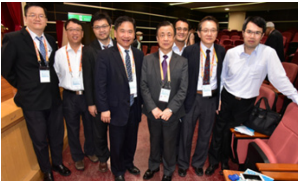
A photo taken at the annual Taiwanese Society of Psychiatry's spring meeting

The spring 2018 conference of the Taiwanese Society of Psychiatry was co-organized by the Taiwanese Society of Addiction, the Taiwanese Society of Forensic Psychiatry, and the National Health Research Institute. The conference took place at Taoyuan Psychiatric Center, Taiwan on 30 May, 2018.