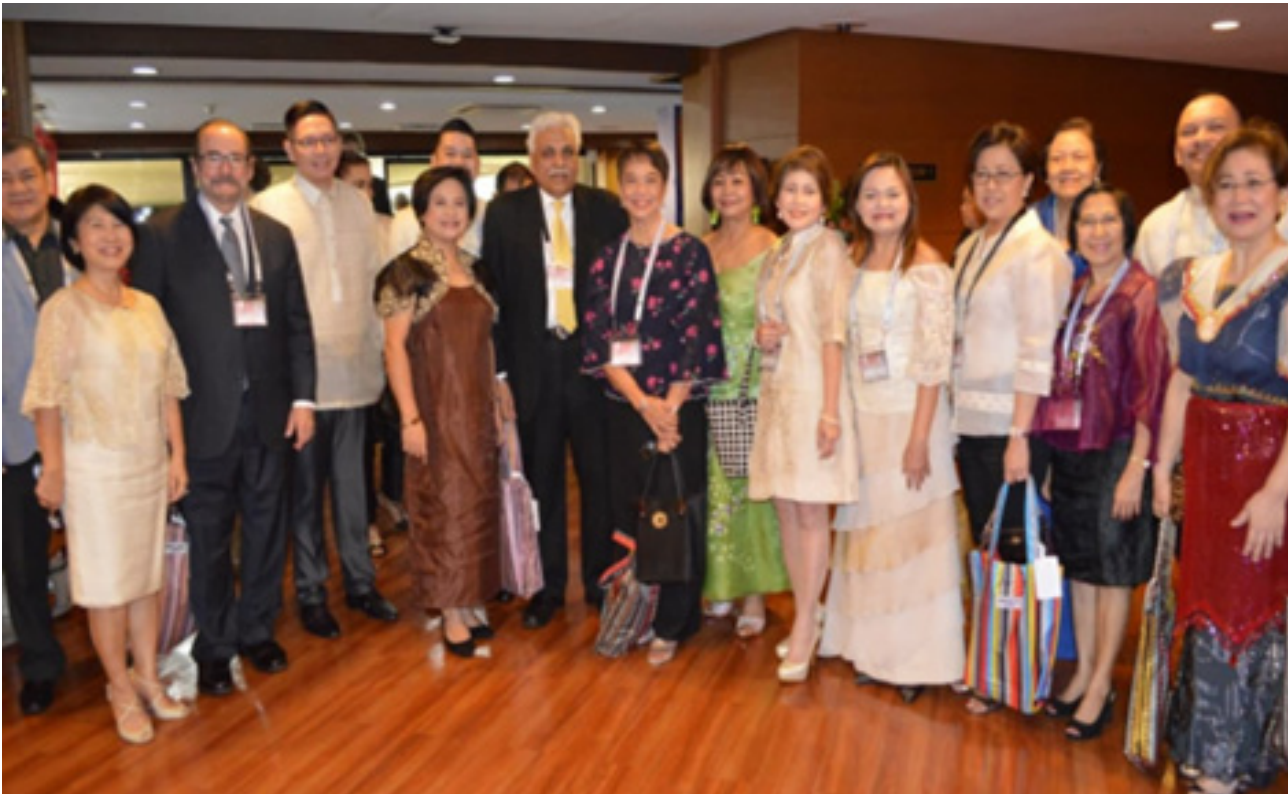
A photo taken at the hallway of the international congress of the AFPA