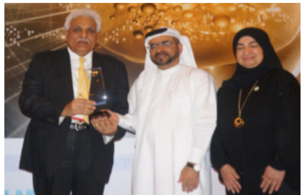
Another photo taken at the ESMH IC in Dubai, UAE, 2018