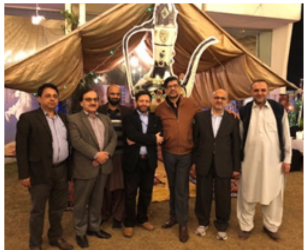
A photo taken at the first seminar on mental health law

In true spirit, all experts expressed opinions to guard basic human and civil rights of the mentally ill. Courts of protection under district magistrates to be assigned as soon as possible. (The author declares no conflicts of interest in writing this report.)