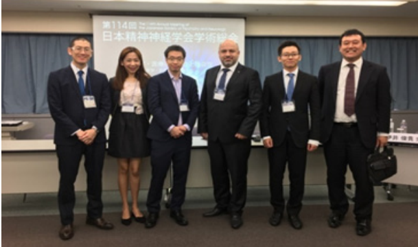
A group photo at the international symposium following suicidal thought research in 2018, Kobe

people answered the questionnaire called “Predicament Questionnaire.” In this questionnaire shows many severe situations which might lead to suicidal thought in the responder and quantifies the degree of suicidal thought. We found several differences among these countries and will publish them.