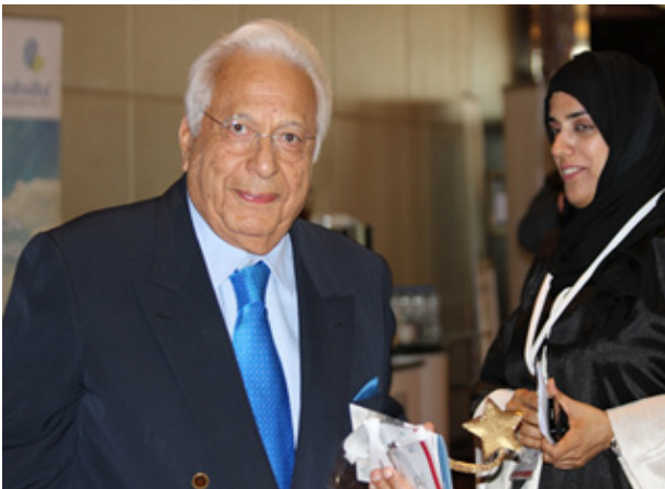
A photo taken at the 8th Emirates Society of Mental Health's international congress in Dubai, United Arab Emirates, 2018

Considerable support and wonderful cooperation came from many associations - World Psychiatric Association (WPA), Asian Federation of Psychiatric Association (AFPA), World Association of Social Psychiatry, European Psychiatric Association, Saudi Psychiatric Association, Indian Psychiatric Society, South Asian Association for Regional Cooperation Psychiatric Federation, Egyptian Psychiatric Association, Indian Association of Biological Psychiatry, Kuwait Psychiatric Association, Indian Association of Private Psychiatry, and Jordan Association of Psychiatrists.