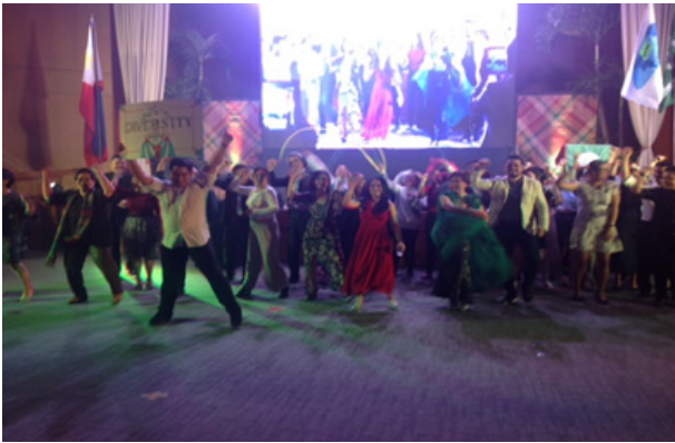
A photo taken at the gala dinner, when the team was performing for the theme of “diversity” during the show “PPA Live!”

The congress successfully brought another opportunity in building new alliances and strengthening partnerships with our neighbouring nations in Asia and across the globe as we advance and shape our future in the field of psychiatry in creating positive impact in our profession and in the lives of our patients. (The author declares no conflicts of interest in writing this report.)