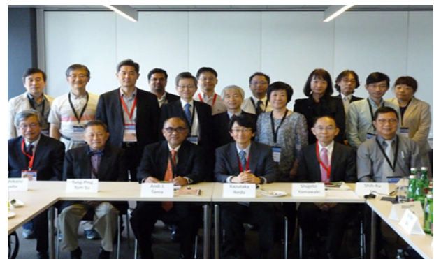
A photo of the AsCNP board meeting on 17, 2018, in Vienna, Austria

On 17 June, 2018, the AsCNP just had a board meeting at the venue of International College of Neuropsychopharmacology (CINP) World Congress in Vienna, Austria. The photo shows the attendees of the board meeting.